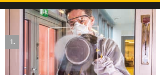
Step 1: For removal of glass scratches sand with Abranet Sic P180 and Mirka PS 1437 Rotary Polisher or Mirka RP 300NV 77mm Non Vacuum Rotary Polisher. Dry or wet sanding.

Sanding time: Never do a short sanding sequence. Wipe clean before next sanding step.