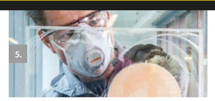
Step 5: Polish with Polarshine E3 Glass Polishing Compound. Use Mirka PS 1437 Rotary Polisher or Mirka RP 300NV 77mm Non Vacuum Rotary Polisher and Mirka White Polishing Felt Pad. Wipe the surface clean to check the surface. Use a soft microfiber cloth and a window cleaning liquid. Continue polishing for 4 minutes or more.