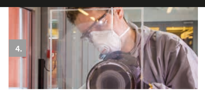
Step 4: The "pre-polish step": Sand with Abralon 600 and continue with Abralon 1000 using the Mirka PS 1437 Rotary Polisher or Mirka RP 300NV 77mm Non Vacuum Rotary Polisher. Dry or wet sanding. Sanding time: Approx. 3–4 minutes for each grit. Wipe clean before polishing.