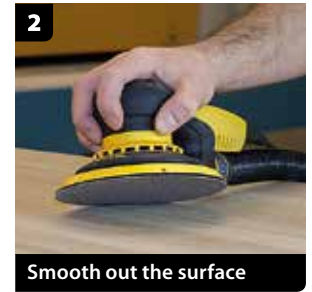
Smooth out the surface