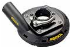
Dust Suction Hood for PS 1437 Polisher