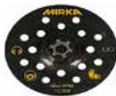
Backing Pad 125 mm M14 Grip 17H for Suction Hood