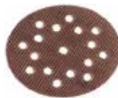
Abranet® HD 125 mm 17 H Grit range P40-P120 Recommended: P60