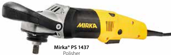
Mirka® PS 1437 Polisher