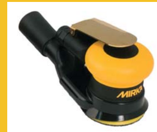
Mirka 77mm ROS325CV

Action: Clean and proceed to Stage 2 Polish.