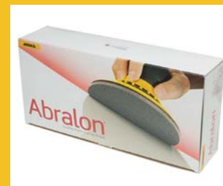
Mirka 77mm Abralon Discs 1000-3000