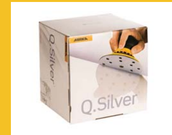
Mirka 77mm Q.Silver Discs P240-P800