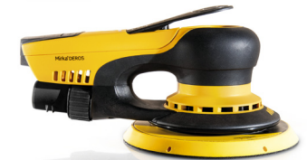
Mirka® DEROS 650CV MID65020CAUS 6", orbit 5 mm