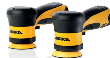
Mirka® ARP-B 300NV ARP300-B 3", Cordless, Orbit 0 mm