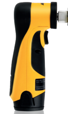
Mirka® AROS-B 150NV AROS150-B 1.25", Cordless, 8000 rpm. Orbit 5 mm