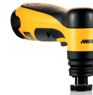
Mirka® AOS-B 130NV AOS130-B 1.25", Cordless, 8000 rpm Orbit 3 mm